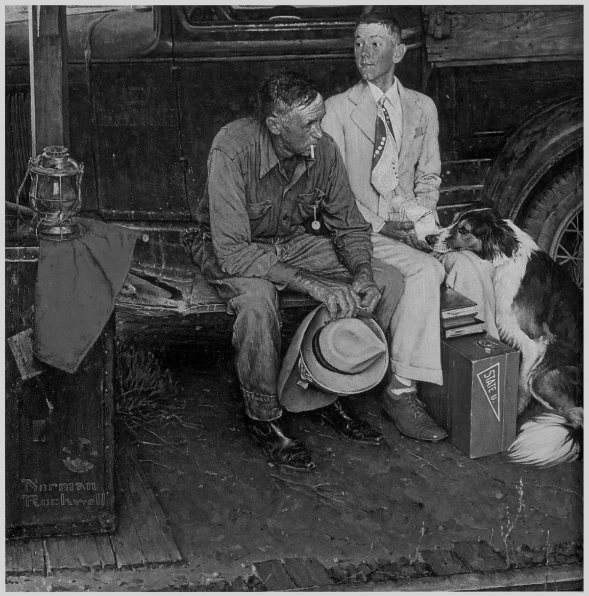
Norman ROCKWELL, Breaking Home Ties , September 25, 1954