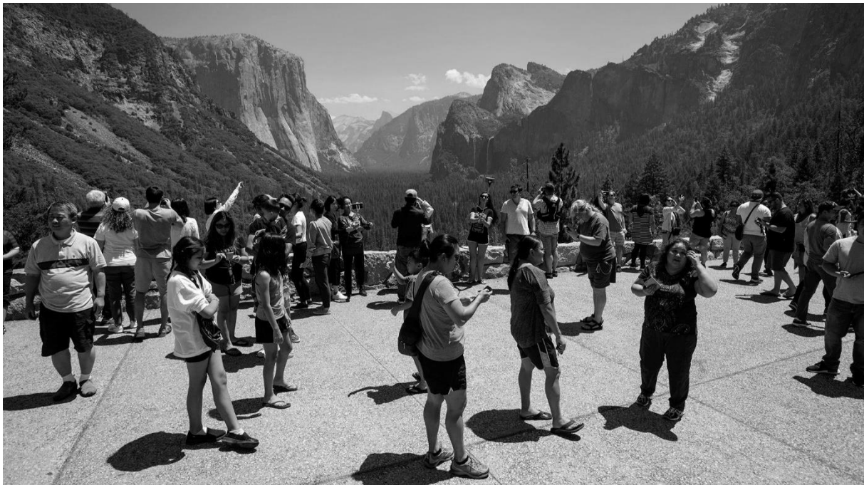
Large crowd gathers at Tunnel View-Yosemite. August 11 th, 2017.