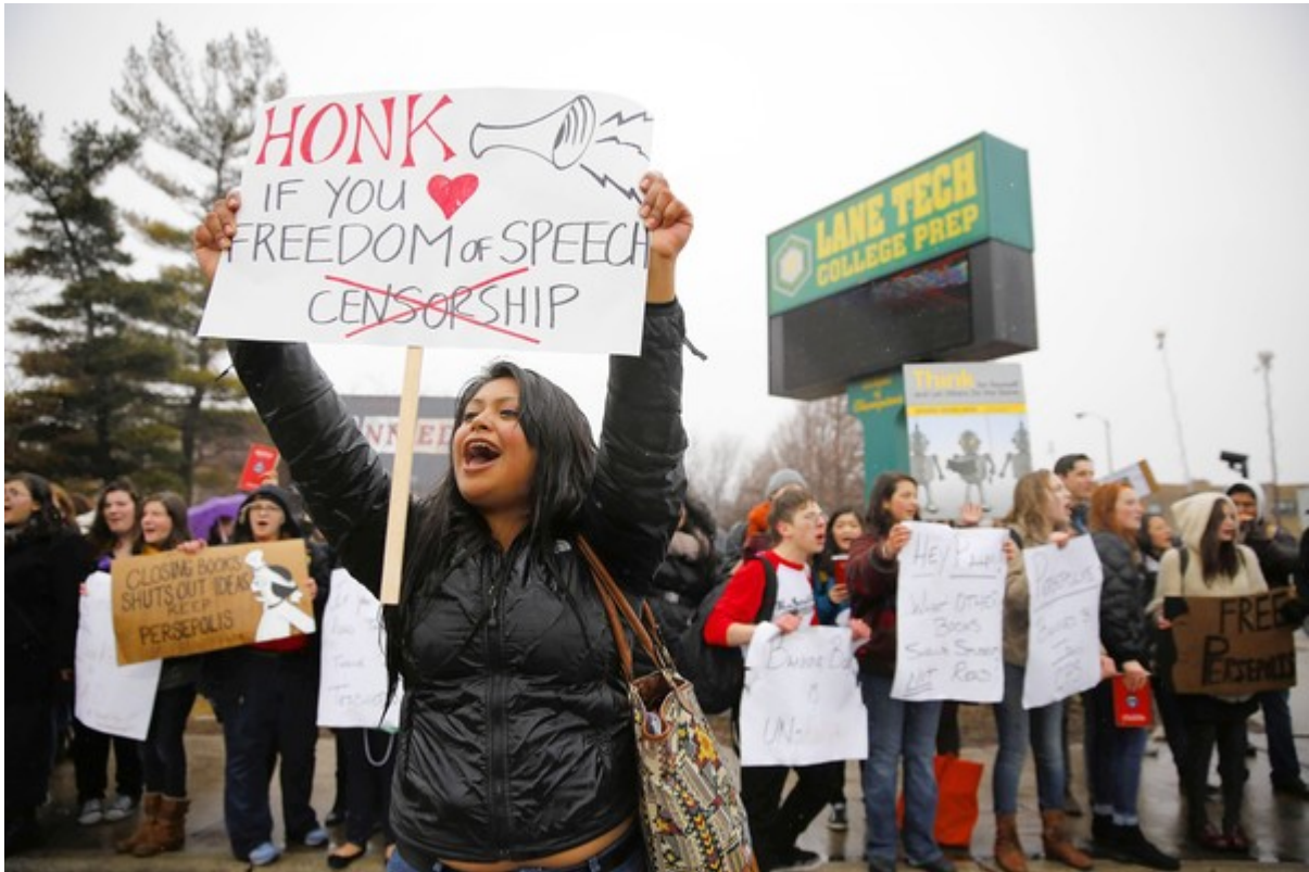
Blog of The National Coalition Against Censorship, March 18, 2018, https://ncacblog.wordpress.com/