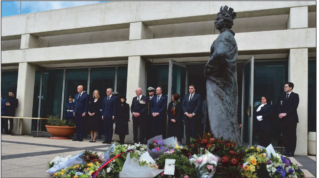
[Australian politicians pay tribute to Queen Elizabeth II at the Parliament House.]