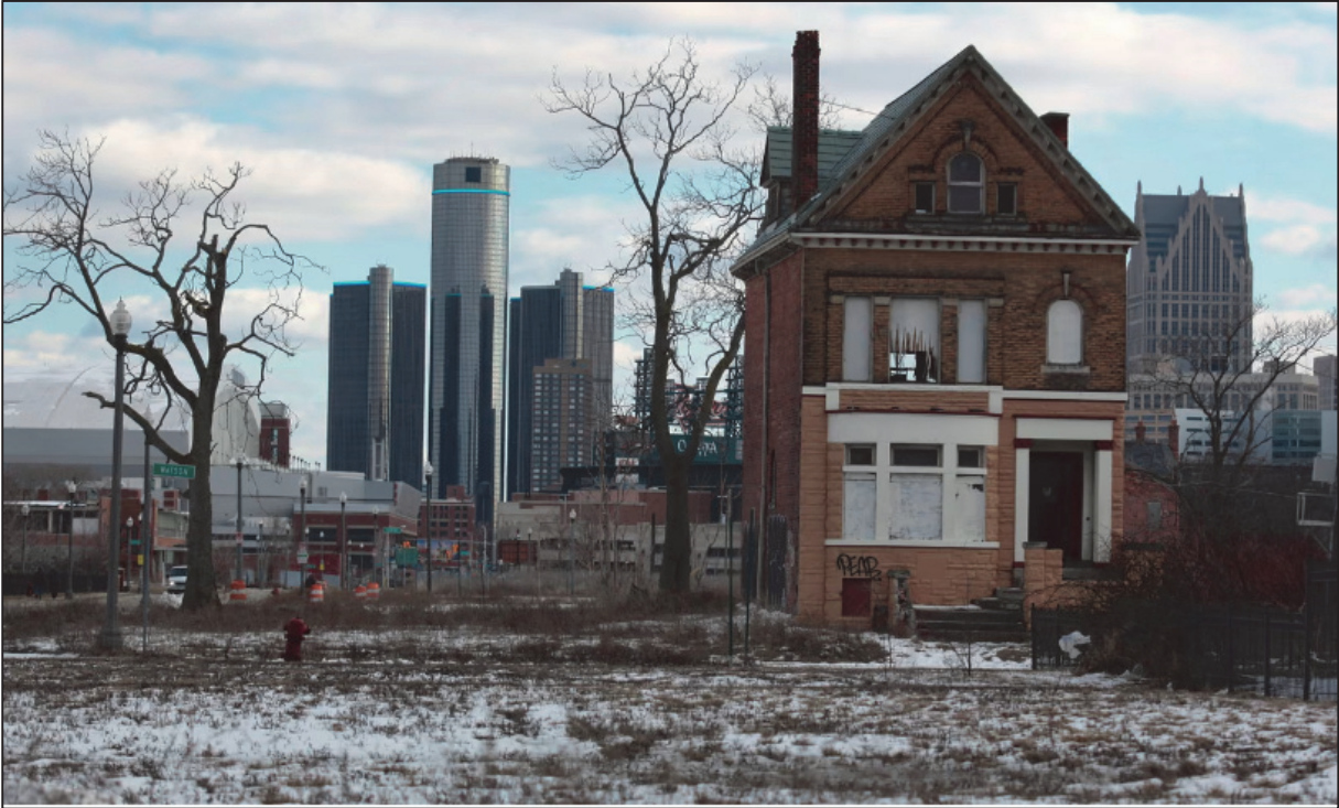
Separated by as little as a city block... a boarded up house in Brush Park with downtown Detroit behind it.